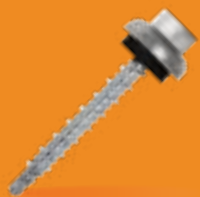
ProZ MINI-DRILL #10 Hi-Lo