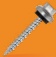
ProZ #10 Hi-Lo