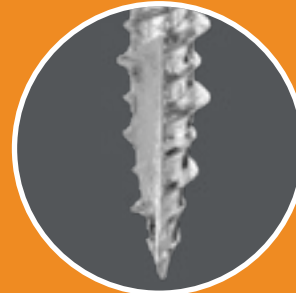
Type 17 Point