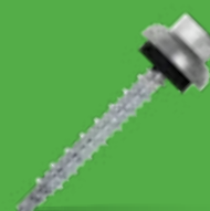
ProZ MINI-DRILLER™ #10 Hi-Lo