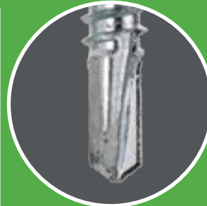
#3 Drill Point