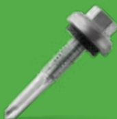
ProZ SD #5