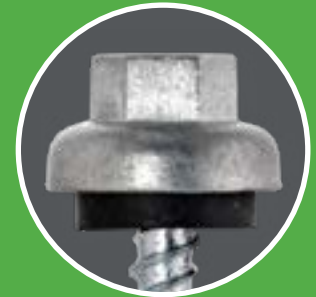
Bonded EPDM Washer