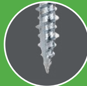
Type 17 Point