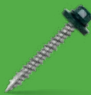
Fastgrip™ #10 Hi-Lo