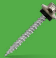
ProCap™ #10 Hi-Lo